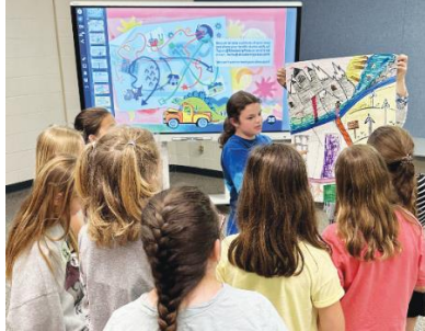
Photo of young library lovers enjoy the SMART Board at the Severna Park Library.

Thanks to your support, all 16 branches now feature new SMART Boards, and we introduced a driving simulator for teens and adults to sharpen their driving skills. We also funded mobile hotspots and Chromebooks, making them available at all library branches.