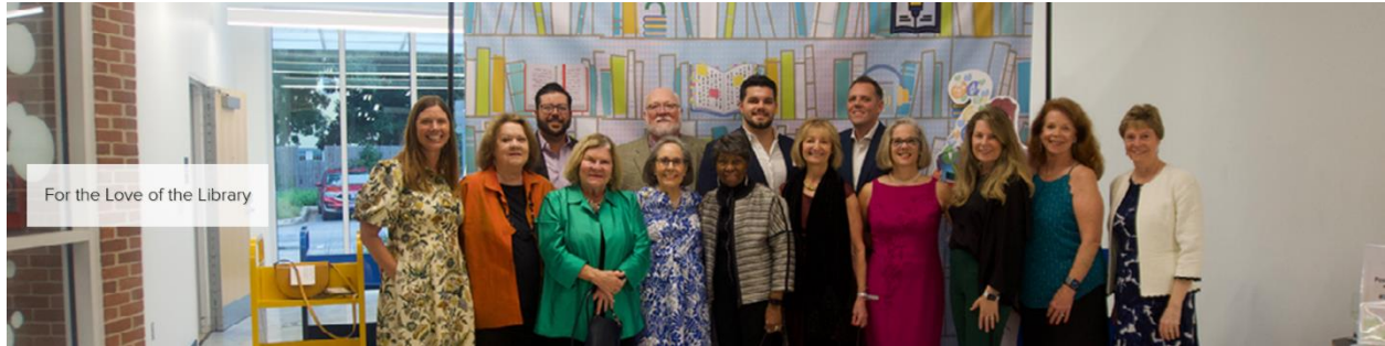
Photo of Library Foundation fundraising event, For the Love of the Library.

We hosted the most successful fundraising event, For the Love of the Library , where attendees explored the exciting library offerings. Events like Cheers to AACPL brought library lovers together to bring awareness to intellectual freedom and the importance of reading banned books, and our unique Read Between the Wines honored veterans. As always, we had another library-themed ice cream, Dragons Love Toffee, for all to enjoy with our partners at Always Ice Cream .