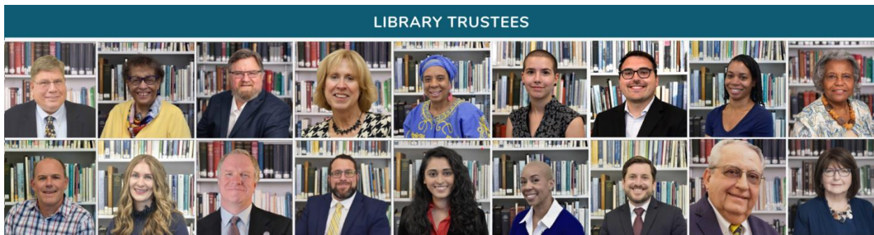
Photo of the Library Board of Trustees.

The Board of Trustees is the governing body of the Anne Arundel County Public Library. It is comprised of volunteers representing all areas of our county. Trustees come to their volunteer roles with a range of experiences and backgrounds, and a strong desire to ensure the long-term vitality of our public libraries. In FY 24, the body included: