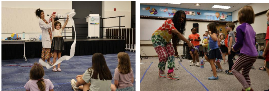
Photos of young children enjoying fun Summer @ Your Library events.

Donations to the Summer @ Your Library program brought our community together with engaging reading activities for all ages, ensuring a summer filled with fun and learning.