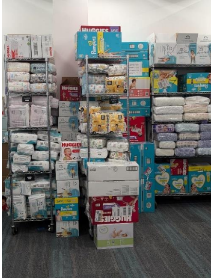
Photo of diaper donations at the Community Pantry at Discoveries.

In FY 2024, the Community Pantry at Discoveries saw an increase in visitors. The staff distributed over 155,000 diapers , which is double the amount from the previous year. Additionally, nearly 2,000 packs of menstrual pads, tampons, and incontinence supplies were given out. A total of 2,635 people visited the pantry , where they also received assistance with signing up for government benefits, registering for kindergarten, obtaining health information and more. We extend special thanks to our funders, including Anne Arundel County, the Library Foundation, Park Books , the Annapolis Mall , Annapolis Moms Media , Junior League of Annapolis , Chick-fil-A , Gloria Dei Lutheran Church , Leadership Anne Arundel and community donors.