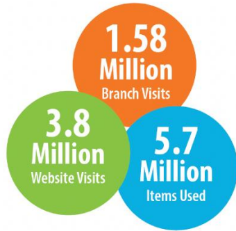
Photo of library usage including 1.58 million branch visits, 3.8 million website visits and 5.7 million items used.