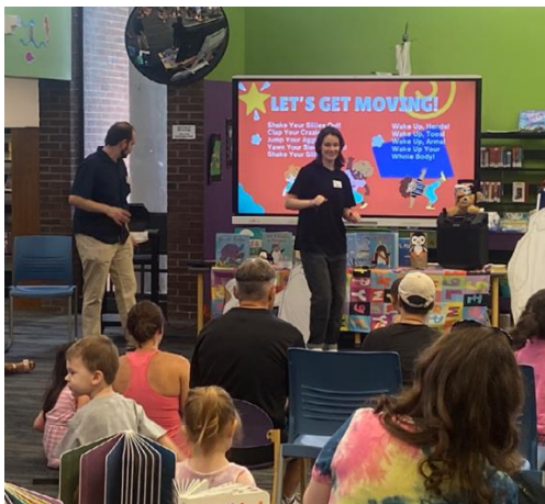
Photo of young children enjoying storytime at the library.