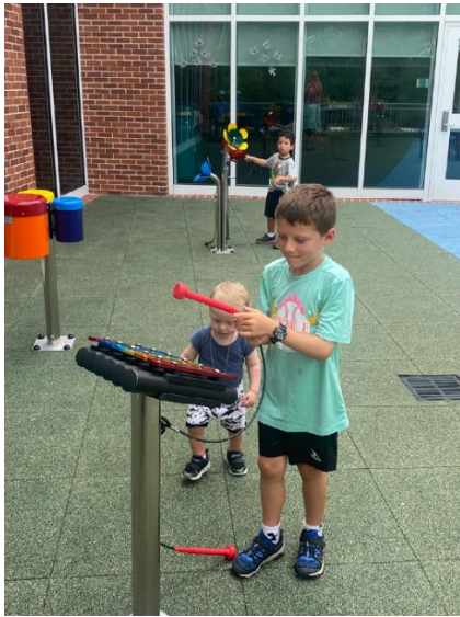
Photo of young customers enjoy the outdoor musical instruments available at the Busch Annapolis Library.

Based on their popularity at the Brooklyn Park Library , two additional branches now offer outdoor musical instruments and play spaces for families and caregivers thanks to funding by community donors through the Library Foundation and Kiwanis Club (Severna Park Library).