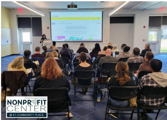
Photo of library users participating in a workshop on finding grants.

Thanks to funding from the Anne Arundel County's Nonprofit Center , all 16 library locations now offer popular grant research tools from Candid . Organizations and individuals can now find funders more easily, as database access has expanded from just the Busch Annapolis Library to all branches.