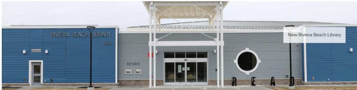
Photo of exterior of new Riviera Beach Library.

On April 25, library and local officials opened the new Riviera Beach Library . The $16 million facility offers a large children’s area, four study rooms, a dedicated teen space, 20 public computers, an outdoor patio, a large meeting room and a brand-new collection of books and other materials. Local architects Grimm + Parker describe the building as having an underwater theme with surfboard-shaped counters, a “boat ceiling,” shark sofa and yellow submarine program space. There are multiple nautical references throughout the library including a coastal type of architecture in materials, color and finishes with oars and anchors.