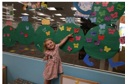
Photo of a happy customer showing off her achievements in the 1000 Books Before Kindergarten program.

Your gifts provided books to children enrolled in the 1000 Books Before Kindergarten program, fostering a love of reading in our youngest community members.