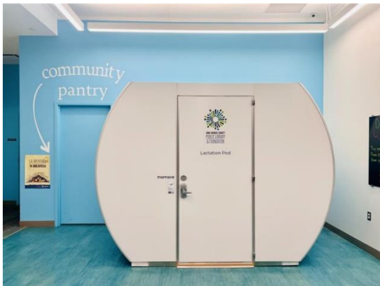
Photo of new lactation pod at Discoveries Library.

A first at a Maryland library, this new lactation pod is very popular with families and caregivers.