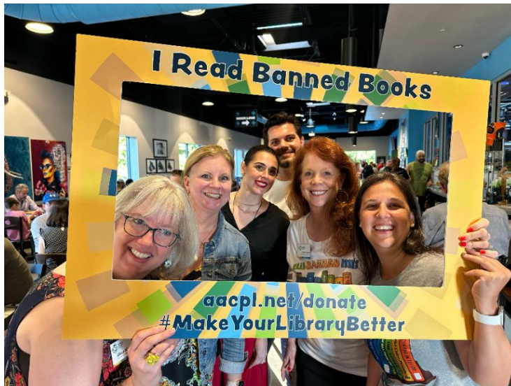
Photo of Library & Library Foundation staff and directors enjoy a special Cheers to AACPL event at Pherm Brewing Company in Crofton.